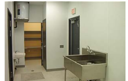
COUNTRY STYLE PREP AREA