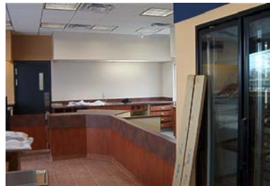
COUNTRY STYLE & COOLERS